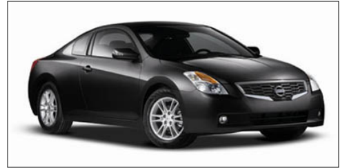
2008 Nissan Altima